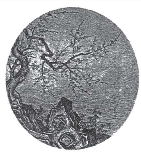
Fig. 9. Returning to the origin, back to the source 返本還源.

From the empty circle we come to the picture of a tree in full blossom, rocks, and a flowing stream. There is no person. Ja-weon says in the preface : "The waters are blue, the mountains are green ; sitting alone, he observes that all things are undergoing rise and fall." Kuo-an recites : "The streams are flowing by themselves boundlessly, and the flowers are vividly red by themselves." 24) One of Kuo-an's juniors mentions in his verse : "Even one hundred different birds