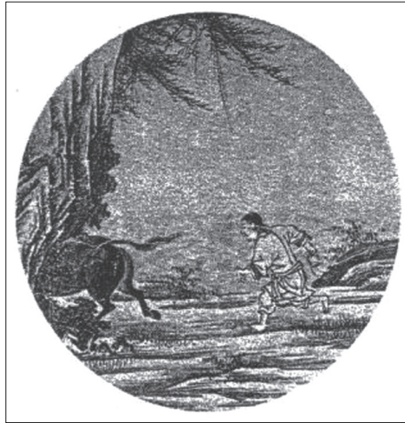
Fig. 3. Seeing the Ox 見牛.

Psychologically, Seeing the Ox means the recognition of the self - self as the