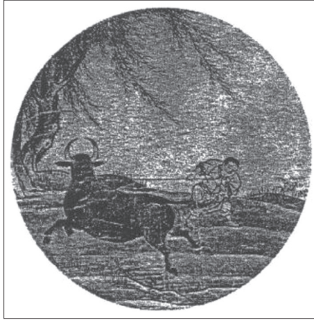
Fig. 4. Seeing the Ox 見牛.