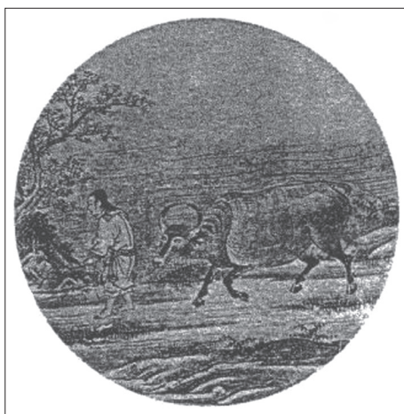
Fig. 5. Herding the Ox 牧牛.

Kuo-an's two juniors praise the well tamed Ox saying : "Sometimes he trod the road of the dusty world, however, he didn't do such things as treading the fields of others and served the master on his back without trouble." "He would