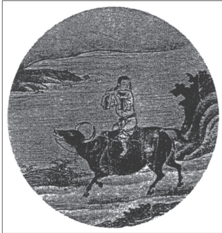
Fig. 6. Coming home on the Ox's back 騎牛歸家.

The picture shows that the boy riding on an Ox merrily playing a flute is returning home. 'Returning home' means returning to the origin, the roots, to One Mind in terms of Buddhism. It means, psychologically, approaching the center of