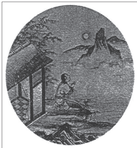
Fig. 7. The Ox forgotten, leaving the man alone 忘牛存人.

The Ox is gone after he brought the boy home. Ox is now regarded as a temporarily guide who brings the boy to his home and after the Ox accomplished his mission, he disappears.