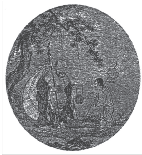
Fig. 10. Entering the city with bliss-bestowing hands 入塵垂手.

For he touches, and lo! The dead tree is in full bloom. 26)