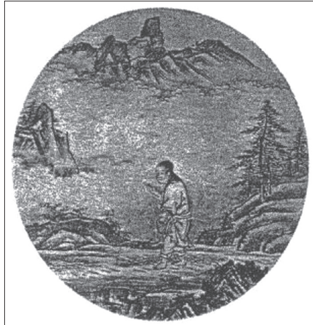
Fig. 2. Seeing the traces 見跡.

By the stream and under the trees, scattered are the traces of the lost ; Did you see the sweet-scented grasses are growing thick. However remote over the hills and faraway the beast may wander, His nose reaches to the heavens and none can conceal it. 9)