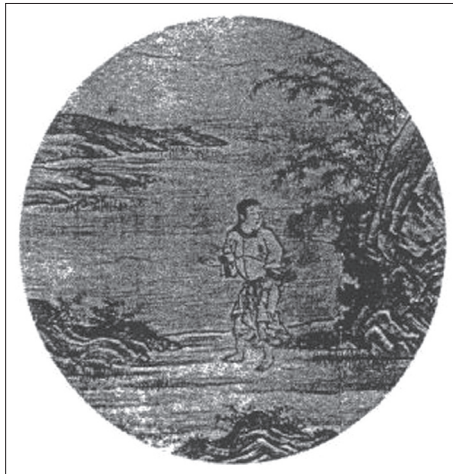
Fig. 1. Searching for the Ox 尋牛.

The Ox symbolizes the true face of the human mind (眞面目) in Buddhism and also in regard to the symbolic meaning of the Ox image in various cultures it undoubtedly represents the central force, the ultimate goal of life, 'the whole