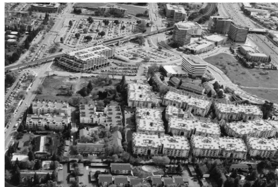
Pleasant Hill BART(2004)

Transit oriented development(TOD) is arguably the most cogent and acceptable form of smart growth. Almost everyone “gets” TOD. Politicians, professionals, and lay citizens alike understand that if there is any logical place to promote compact, mixed-use development, it is in and around transit stations. The benefits of TOD are largely borne out by empirical evidence. People who live near rail transit stops in the U.S. have much higher rates of transit use than the typical resident of a rail-served region. In California, surveys show that residents who live near a transit station use transit for their commutes at a rate four to five times higher than residents of the same region who don’t live near stations. This pattern has held steady over time. In the case of the