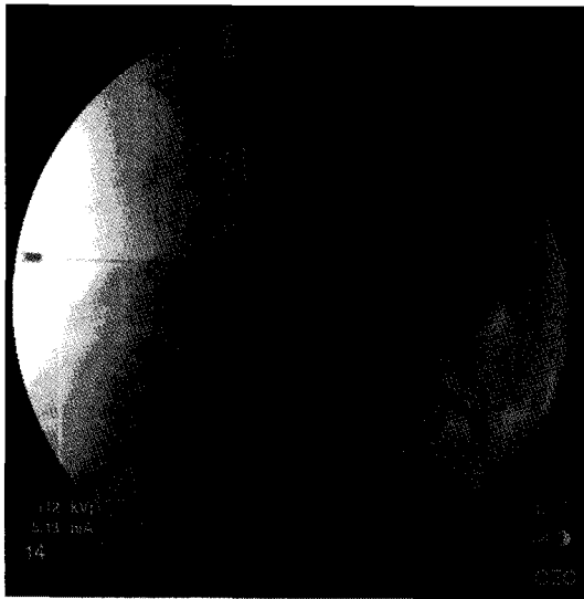
Fig. 3. Fluoroscopic image during the rami communicans nerve block (lateral view).

of contrast medium was injected to confirm the absence of intravascular, somatic nerve root, or epidural placement (Fig. 3). Next, a mixture of 2 ml of 1% mepivacaine and 10 mg of triamcinolone was injected on each side. The nerve blocks were performed once a week for two consecutive weeks. His pain improved dramatically immediately after the nerve block (VAS score 2/10); there were no serious procedure-related complications. At the 1-month follow-up, the patient had slight back discomfort (VAS score 2/10).