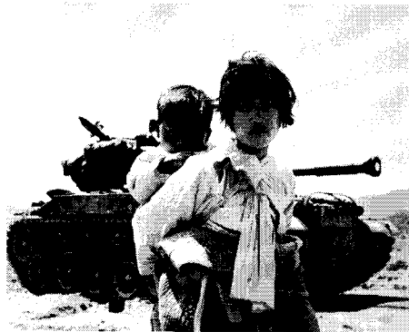
Fig. 2. National archives.

The images of Korean children often are used as examples to show the U.S. soldiers' compassion for Koreans (sign #2). One veteran testified that he found a small Korean child, crying right next to his/her old man's dead body. During the interview, he showed his genuine compassion for the child. His compassion seemed to represent the compassionate feelings of all Americans toward Koreans. By showing the soldier's compassion in the film, the U.S. military action in Korea could be justified as an action to protect poor Koreans. The stories of Korean children repeatedly were presented throughout the whole film. These stories generate national pride as rescuers and protectors for the people in the U.S. When the narrator states, "Americans had to fight for another country's freedom," it is presented with a strong, determined voice. By hearing the statement, the American audiences might feel national pride.