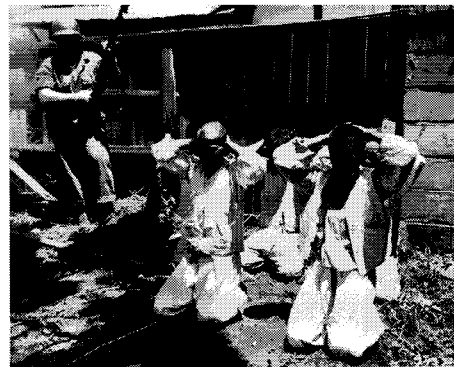
Fig. 3.

Consequently, the film promotes national pride and patriotism toward the U.S. by depicting Americans as being compassionate, powerful, and technically superior. The emphasis on national pride and patriotism was strongly connoted underneath the film's direct message.