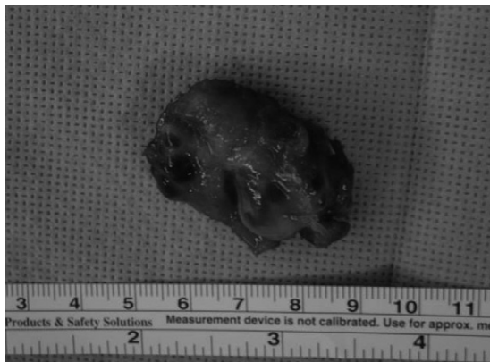
Fig. 4. Dark-red colored mass was removed from distal forearm.

Intravascular papillary endothelial hyperplasia is not a common disease, it could be developed in any areas of body, and it is developed primarily in the dermal area or subcutaneous tissues of the head, neck, fingers and trunk 6) . In 1923, Masson 8) considered intravascular papillary endothelial hyperplasia as benign neoplasia and termed as "Vegetant intravascular hemangioendothelioma", and reported for the first time, and 1932, Herschen 4) reported it as intravas-