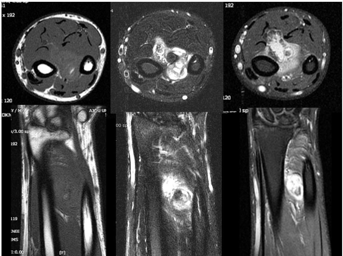
Fig. 2. Magnetic resonance imaging shows the mass showed nodular high signal intensiteis on precontrast images, heterogenous enhancement was noted after contrast enhancement. The center of mass seemed to be located among flexor pollicis longus, flexor digitorum and interosseous membrane.