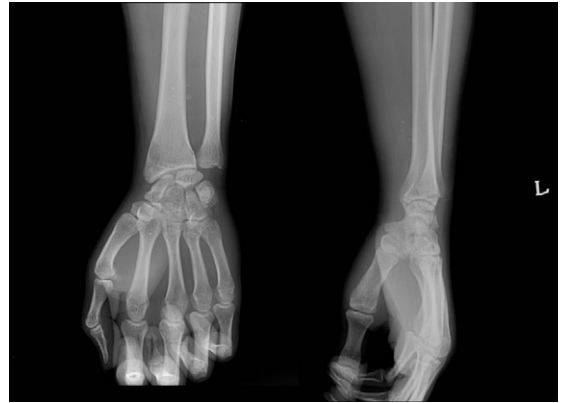
Fig. 1. Plain radiograph shows soft tissue swelling with small round calcification in distal forearm.