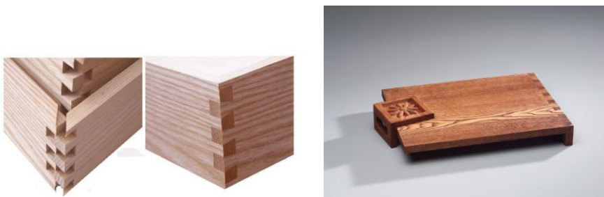
Fig. 2. The structure of dovetails and the finished drawer design by using dovetails.

Second, Dovetails are observed mostly in the Korean traditional furniture, especially from Chosen Dynasty. Also, on gluing, it can strengthen the durability. Although it is similar to the Finger Joints in the one hand, the dovetail joint has the fixed angle which helps to pull the joint out one end and prevents it from pulling out in one end and prevents the joints from pulling out in the other end. Especially, it can minimize the deformation like shrinking and expansion. Figure 2 describes the structure of dovetails and the finished furniture product.