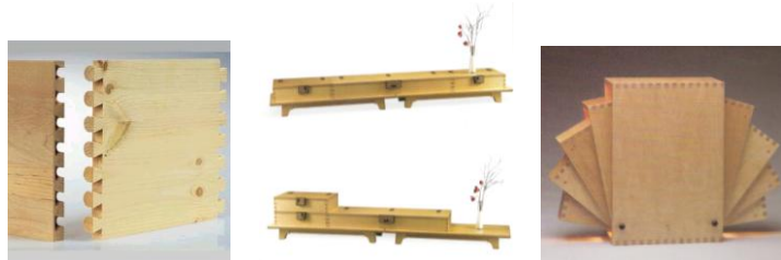
Fig.4. Examples of design for wooden furniture, using by the joinery technique machine.

The results indicate that, in case of finger joints, using the machine can shorten the fabrication time into 1/8 of consumption time by handcraft. That is, to use machine can positively influence on the development of design for wooden furniture via using the joinery technique. Therefore, it is urgently executed to introduce the machine tools, operational plan and motivation of various design ideas for wooden furniture. Figure 4 is the tentative furniture design by joinery technique machine. It is expected to extremely slash the production time which is consumed by handcraft and lead the further development for the future model.