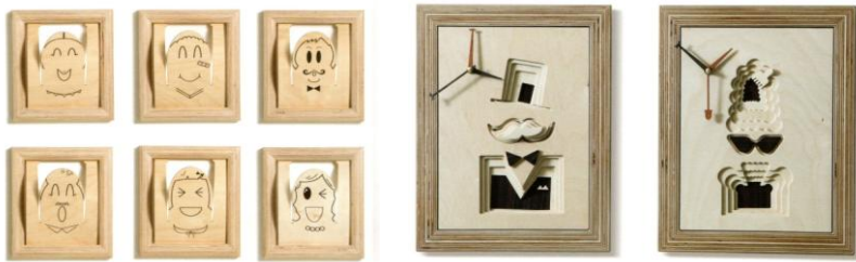
Fig.5. Design example of the interior good by the machine tools with the joinery technique.

Second, the practice courses should be planned for the aesthetic features of wooden planes (cross section and longitudinal section) around the Dovetail junction. Especially, finger joints or dovetailings can lead the aesthetic design due to the segmentation plane itself without the additional apparatus. So, the design to use the born aesthetics by joints should be developed.