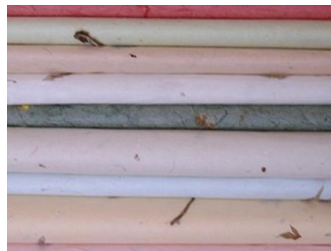
(b) Wallpaper made of Hanji