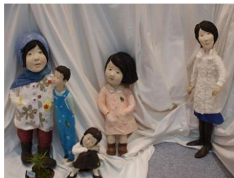
(a) Paper dolls made of Hanji

Currently traditional Japanese paper, Washi, is well known as an essential material in paper conservation in the western world. Unfortunately in spite of excellent features Hanji has been little globalized compared to Washi. This is the time that more concerns and more affection on Hanji is needed. This is because Hanji is a legacy containing our spirit inherited from ancestors in Korea over time. It is fortunate that Korean government has been driving diverse projects for conserving Hanji-making craft as well as for its globalization.