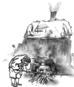
(b) Cooking I