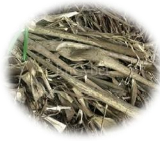
Fig.4. Mulberry trees and their barks.