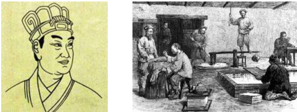
Fig.1. Ts'ai Lun as a father of handmade paper (left) and Chinese ancient papermaking craft (right).

As shown in Fig.1, paper continued its journey from east to west through Spain conquered by the Moors in the 8 th century. The European crusader contributed to the extension of papermaking skills to Europe via Spain. It took around 500 years for papermaking to reach Europe from Samarkand. It was a shame that early paper was at first disfavored by the Christian world as a manifestation of Muslim culture, and Holy Roman Emperor Frederick II in 1221 declared the all official documents recorded on paper not to be valid. There was a big turning point able to change European attitude toward paper. This was the advance of the printing press in the 1400's. The first paper mill to be documented was established in Fabriano, Italy in 1268 AD and Cartiere Miliani Fabriano is still in operation today.