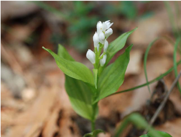
Fig. 2. Photograph of Cephalanthera erecta var. oblanceolata N. Pearce & P. J. Cribb taken from Gyeonggi-do, Whaseong-shi, Seosin-myeon on May 19, 2009.

Terrestrial herbs , height 18-30 cm. Roots cylindrical tuberous. Stem erect, 1-3 mm thick, with sheaths at lower part. Leaves alternate, ovate to ovate-lanceolate, apex acute to subacute, sessile, prominently 3-5 nerved, 5-7 cm long, 1.5-2.0 cm wide. Inflorescences terminal, racemose, 6-8 flowered; rachis 4-7 cm long. Flowers whitish, 0.7-0.9 cm long; pedicel including ovary 5-8 mm long; bracts lanceolate, acute, 2-3 mm long, 0.5-1.0 mm wide; lowest floral bract foliaceous, lanceolate, apex acute, 1.2-1.5 cm long, 3 mm width; dorsal sepal oblanceolate, subacute, 3 nerved, 10 mm long, 2.0 mm wide; lateral sepals lanceolate, subacute, 3 nerved, 9-12 mm long, 2.0-2.3 mm wide; lateral petals oblanceolate, apex obtuse, 3 nerved, 9-10 mm long, 1.5-2.5 mm width; lip simple, peloric, oblanceolate, obtuse, 3 nerved, 9-10 mm long, 2.0-2.5 mm wide; column straight, erect, narrowly two winged at apex, 3.5 mm long; stigma broad, fleshy; pollinia 1.5 mm long, 1 mm wide. Fruits capsule.