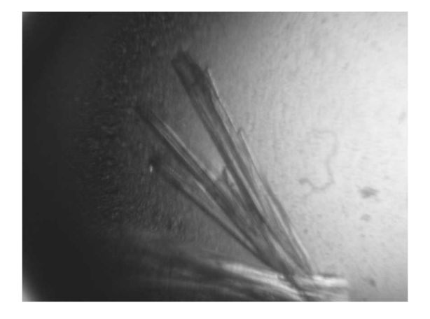
Figure 1. Crystals of visfatin-IS001 complex. Visfatin-IS001 complex was crystallized using the hanging drop vapor diffusion method at 294 K. Crystals of the complex were made by mixing 1 \mu L of protein solution and the same volume of reservoir solution containing 0.2 M MgCl<sub>2</sub>, 16% (w/v) PEG 3350 and 0.1 M Hepes-NaOH (pH 7.5).

48.9%,<sup>14</sup> which is typical for protein crystals. Initial molecular replacement calculations were carried out with MOLREP<sup>15</sup> using search models based on the structure of Rattus norvegicus visfatin (PDB code 2G95). At present, model building and refinements are ongoing. The statistics for data collection are summarized in Table 1.