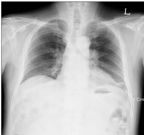
Figure 1. Chest PA view shows bilateral hilar lymphadenopathies.