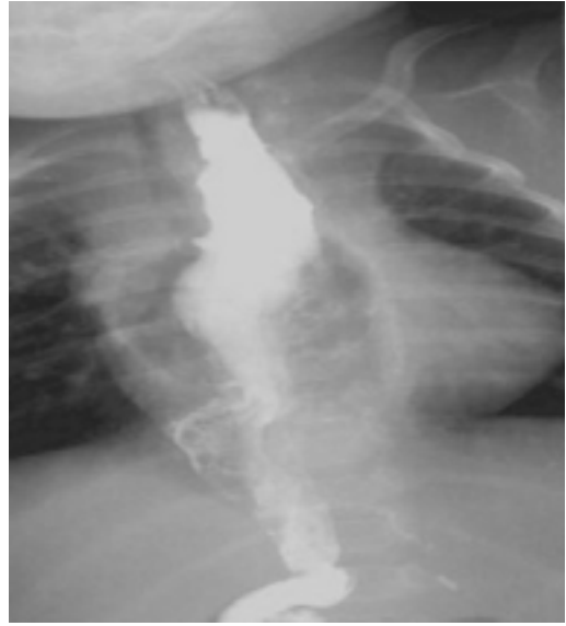
Fig. 2. Postoperative esophagogram shows no leakage and stenosis at anastomotic site.

가 10~12 mmHg 가 PDS black silk PDS black silk 가 6 23 (Fig. 2). 42 2 가 가 38 , 2.9kg(3~10 percentile), 50cm(25 percentile) 1/3 가 (Graft failure) (gastric tube) 7 (Fig. 3A). (Blind