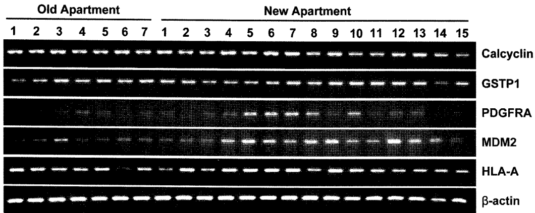
Fig. 2. Induction of gene transcripts in human peripheral blood monocytes obtained from residents of new buildings. Human blood samples were collected from 7 controls in old apartments and total 15 residents in new apartments as described in Table 1. The mRNA expression of the indicated gene was determined by RT-PCR with primers that are specific for each gene. Representatives of at least 3 independent experiments were shown.