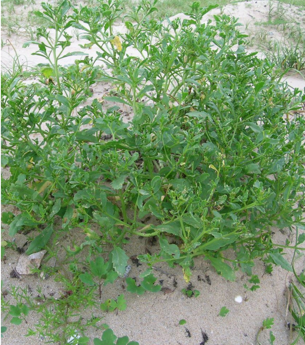
Fig. 1. Cakile edentula Hook. established in Gangnung sand dune, Gangnung City, Gangwon Province, Korea.