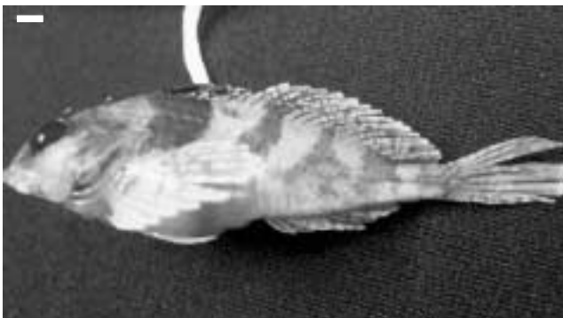
Fig. 3. Porocottus leptosomus from Weihai, Shandong Peninsula, China, 39.4 mm SL, KNUM 1778.

Material examined. KNUM 1779, 39.8 mm SL, Xiaoshidao, Weihai, 1st Feb. 2007; KNUM 1777~1778, 39.7~41.7 mm, Yuanyaozui, Weihai, 17th Apr. 2007.