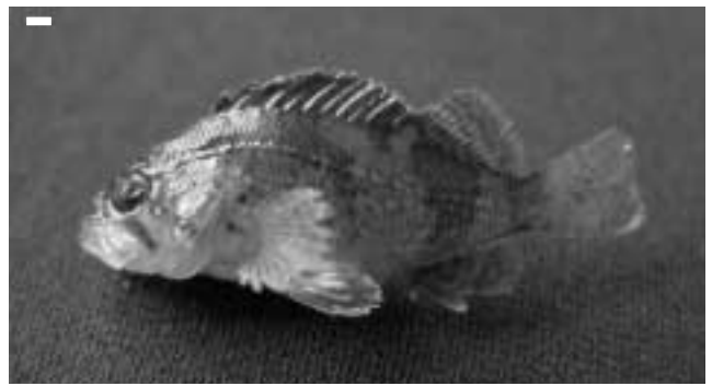
Fig. 2. Sebastes koreanus from Weihai, Shandong Peninsula, China, 29.1 mm SL, KNUM 1781.

Material examined. KNUM 1781 ~ 1783, 27.0 ~ 29.1 mm SL, Yuanyaozui, Weihai, 10th Aug. 2006; KNUM 1784, 57.5 mm, Badaguan, Qingdao, 16th Apr. 2007; KNUM 1785 ~ 1788, 36.7 ~ 49.8 mm, Jinhaiwan, Weihai, 16th Sept. 2007; KNUM 1789 ~ 1792, 31.4 ~ 71.8 mm, Badaguan, Qingdao, 15th Sept. 2007.