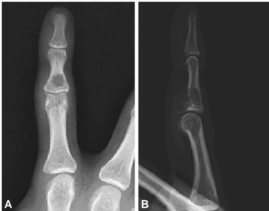
Fig. 1. Anteroposterior (A) and lateral (B) radiographs show the eccentrically located well-defined cystic lesion in the middle phalanx of the index finger, with cortical thinning, but no surrounding sclerosis or mineralization within the radiolucent area.

The giant cells in GCT are uniformly distributed, more rounded, and are larger, as opposed to the giant cells in GCRGs, which are gathered around hemorrhagic foci, irregular shaped, and smaller. There is evidence of recent and remote hemorrhage in GCRGs