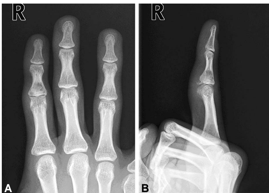
Fig. 3. Anteroposterior (A) and lateral (B) radiographs show complete union at postoperative 12 months.

with new osteoid formation, whereas in GCT there is limited fresh hemorrhage despite its rich vascularity and no osteoid formation 3,5 . GCRGs has benign clinical course although it is locally aggressive, whereas GCT has more malignant course, higher rate of recurrence, and reported to metastasize 4 .