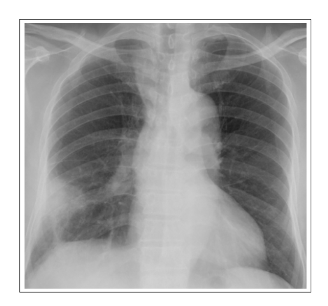
Figure 3. A chest radiograph obtained 18 days after treatment shows mild improvement in air space consolidation.

on patient's clinical response. Blood cultures were negative for A. baumannii . Sputum acid-fast bacilli smears were also negative and culture results were pending. Laboratory evaluation for Legionella and Mycoplasma were negative. On the 10th days, Second sputum culture also yielded a growth of A. baumannii to which all tested antibiotics were susceptible.