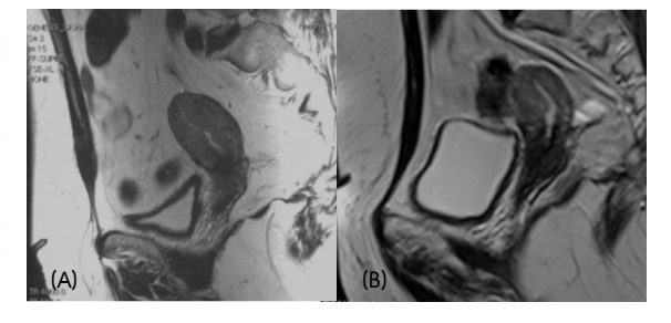
Fig. 2. MRI sagittal T2WI shows endometrial carcinoma with deep myometrial invasion with no invasion to cervix on Aug 2002 (A) and no significant interval change on Jan 2005 (B).