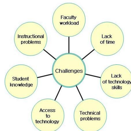
Figure 3. Challenges of blended instruction

The practices in and effectiveness of blended instruction were different based on instructional situations and institutional policies. While certain institutions required faculty to employ online tools as a supplement to classroom instruction, other institutions were concerned about the quality of instruction when replacing classroom instruction with online instruction. In most cases, the decision to adopt different instructional formats was made by department or faculty rather than institution. However, institutional support in pursuing diverse instructional delivery formats was important in creating successful learning environments. One of the suggestions made by a participating respondent makes sense; he suggested using a course management system or technology provided by the university rather than using a personal website so that faculty can get help at any time. Many other faculty respondents also provided valuable suggestions to be considered when developing and delivering blended instructional methods;