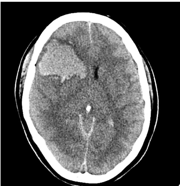
Fig. 3. Photomicrograph of the biceps-brachialis muscle biopsy shows widespread muscle necrosis in each of the fascicles (H & E \times 400 ).

Since the ICH was very huge and the evacua-