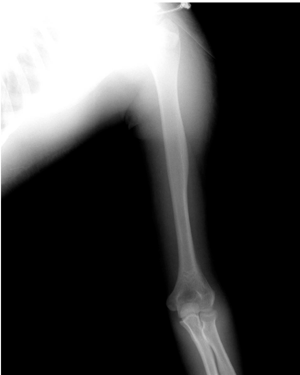
Fig. 1. Radiographs of the upper arm shows soft tissue swelling around left upper arm without fracture.

A 25-year-old woman was admitted to the orthopedic clinic for contusion of his left upper arm caused by blunt impact after fall. The patient was alert at the time of injury. Progressive swelling and pain developed in the left upper arm. Four days later, she was referred to our hospital due to sudden loss of consciousness. The patient didn't exhibit fever. Physical examination revealed swollen and stiff lesions on the left side of her upper arm. Radiographs of the upper arm showed soft tissue swelling around left upper arm. But there was no definite fracture (Fig. 1). Chest radiograph and electrocardiogram showed no abnormal features. Neurological examination showed coma with fully dilated and