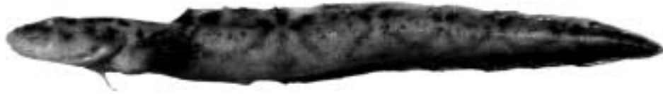
Fig. 2. Lycodes japonicus Matsubara and Iwai, 1951, CNUC 36505, 125.0 mm TL, from off Samcheok-si, Gangwon-do, Korea.

lower jaw in a broad band anteriorly. Dorsal fin originating above middle of pectoral fin. Pectoral fin rounded, moderately large. Pelvic fin small, longer than eye diameter. Body covered with small cycloid scales head and belly naked. Lateral line anteroventral,