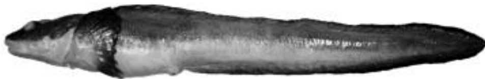
Fig. 3. Lycodes pectoralis Toyoshima, 1985, CNUC 36493, 343.3 mm TL, from Uljin-gun, Gyeongsangbuk-do, Korea.

Description. Counts and measurements are given in Table 1. Body rather elongate and moderately deep. Head relatively small. Mouth small, posterior end of upper jaw reaching anterior half of eye. Snout somewhat pointed. Nostril tube very short. Teeth small and conical. Body densely covered with cycloid scales. Lateral line ventral, very distinct, starting from apex of gill opening, descending toward anus and then running along base of anal fin almost to base of caudal fin. Pelvic fin small, shorter than eye diameter.