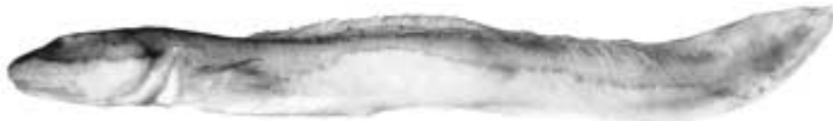
Fig. 1. Lycodes sadoensis Toyoshima and Honma, 1980, CNUC 36593, 160.3 mm TL, from off Yeongdok-gun, Gyeongsangbuk-do, Korea.

Description. Counts and measurements are given in Table 1. Body elongate, compressed, tapering to tail. Head moderately large with round snout and very large mouth. Teeth conical those on upper jaw in a single row and those of