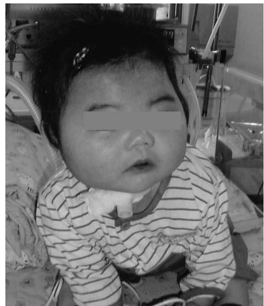
Fig. 4. Follow up photos of the patient at 8 months of age shows the ability to control her neck, to sit by herself without assistance and to breathe without mechanical ventilator assistance while awake.