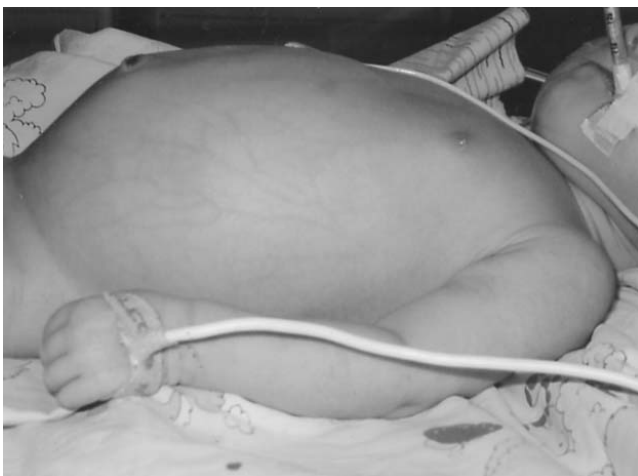
Fig. 1. The patient's general appearance shows a markedly distended abdomen.

A female neonate was transferred to our hospital on the second day after birth with complaints of frequent apneic and cyanotic episodes. The patient was born as a full term baby via a normal vaginal delivery and weighed 2,930 g. Fetal monitoring showed no perinatal history of dystocia or antenatal fetal distress. The Apgar scores were 8 at 1 minute after birth and 9 at 5 minutes. There was no maternal history of polyhydramnios, premature rupture of the amniotic membrane or meconium staining. There was no family history of congenital anomalies, neuromuscular disorders or maternal exposure to drugs during pregnancy. The physical examination showed that the patient had a mild abdominal distension (Fig. 1). The body temperature was 36.8°C, heart rate 150/min, respiration rate 30/min, body weight 2,930 grams (10–25 percentile), height 50 cm (50–75 percentile), and head circumference 30 cm (0–3 percentile). Auscultations of the patient did not reveal any murmur or abnormal breathing sounds. The anterior fontanel was not bulged and palpated soft. No abnormal mass or organomegaly were suspected upon the palpation of the abdomen. The neurological examination revealed that the patient had a normal symmetric Moro reflex. The initial laboratory findings showed the following: Hemoglobin 13.1 g/dL, WBC 31,630/mm 3 (segment neutrophils 60%, lymphocytes 36% and meta-myelocytes 3%), platelets 269,000/mm 3 . The blood chemistry results were within the normal