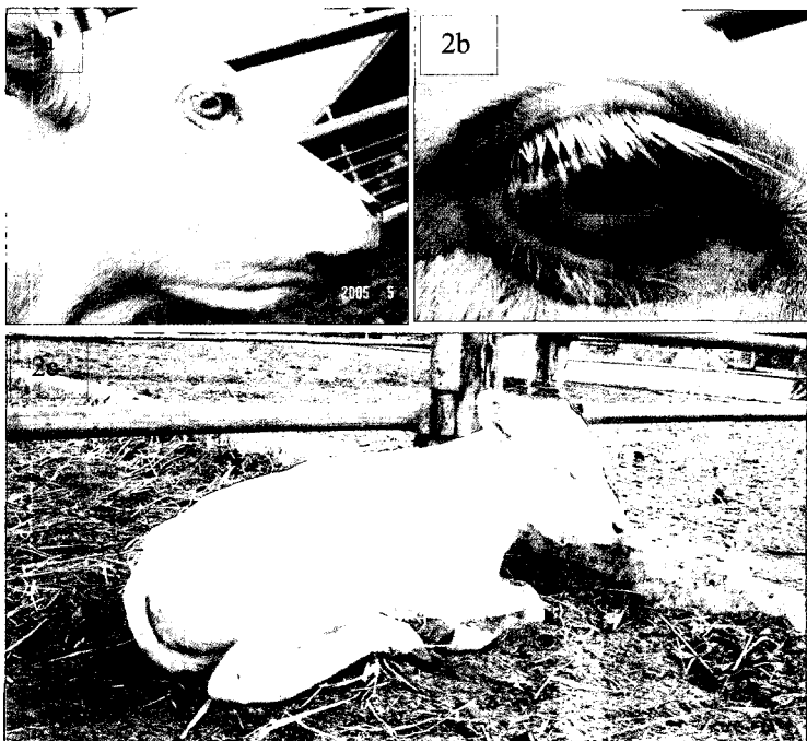
Fig 2. The calf showing integumentary and ocular involvement (2a). Closer view of the eye (2b). The calf apparently avoiding the light (2c). Note the lighter appearance of the muzzle, hooves and the pink color of the iris of the eye