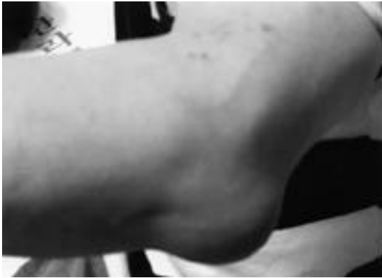
Fig. 1. The photograph shows 5 × 4 cm sized mass, presented in 40-year-old male.