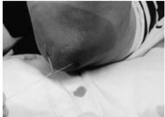
Fig. 6. Tie was performed at 2 cm apart from the skin.