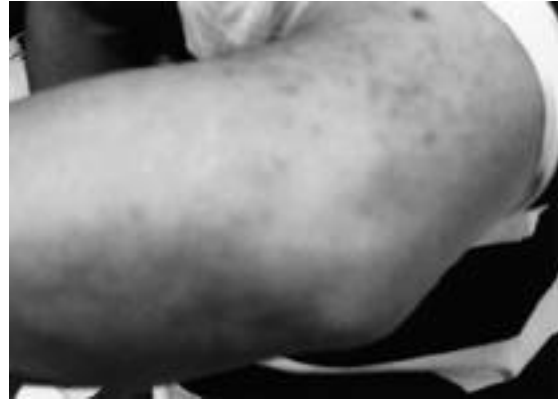
Fig. 2. The photograph shows resolution of the bursitis after treatment.