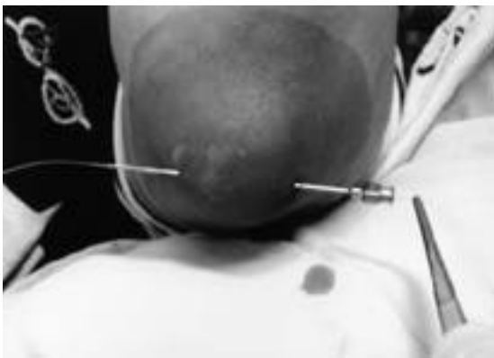
Fig. 5. Silk suture (No. 7) was inserted through the needle.