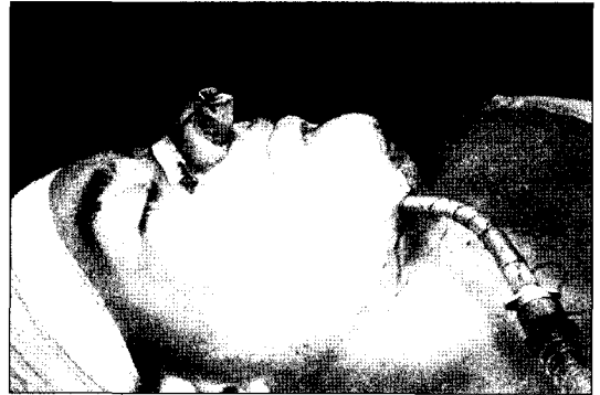
Fig. 3. With submental intubation, Nasal bone fracture was corrected with intermaxillary fixation at the same time.

the advantage, disadvantage and the procedures of the submental intubation.