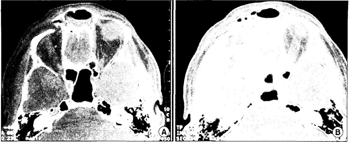
Fig. 1. The CT view of multiple maxillofacial bone fractures.