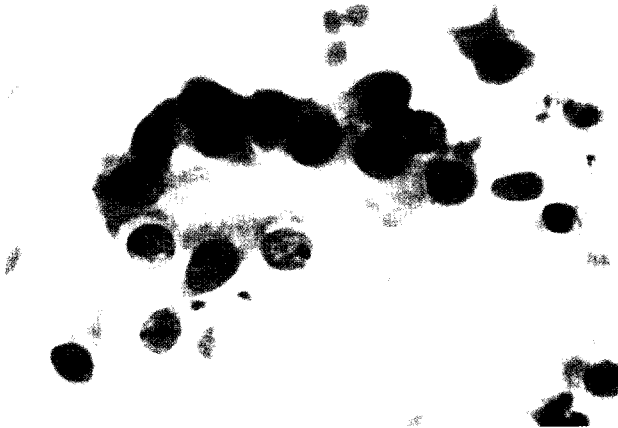
Fig. 3. Cytologic finding of cervical smear : The tubular structure is composed of epithelioid cells with moderate amount of cytoplasm and round nucleus with occasional small nucleolus. (Papanicolau)