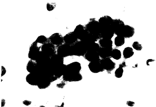
Fig. 4. Cytologic finding of cervical smear : The round tumor cells in cluster have scanty cytoplasm and round nucleus with distinct nuclear membrane and a prominent nucleolus. (Papanicolau)

pedunculated submucosal mass attached to the fundus with stalk. On section, the mass was yellowish white and soft with multifocal hemorrhages. Microscopically, the endometrium was atrophic and the surface epithelium was composed of a single layer of cuboidal cells. The tumor was composed of diffuse sheets of round to spindle cells and scattered small tubules or large elongated tubules (Fig. 5A). In areas, the stroma was hyalinized and contained small tubules and irregular shaped, cleft-like structures lined by cuboidal cells, reminiscent of sex cord tubules (Fig. 5B). On higher