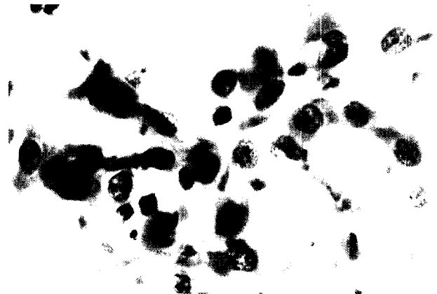
Fig. 1. Cytologic finding of cervical smear: Reactive squamous cells originating from cervix are seen. (Papanicolau)

The cervical smears were bloody and contained reactive squamous cells (Fig. 1) and multiple tumor cell