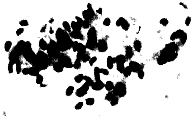
Fig. 2. Cytologic finding of cervical smear: The aggregate of short spindle cells with cytoplasmic process and oval to elongated nucleus are arranged in palisade. (Papanicolau)

clusters. The tumor cells in loose aggregates had short cytoplasmic process and oval nuclei arranged in palisade (Fig. 2). The tumor cells forming tubular structures had moderate amount of cyanophilic cytoplasm and round nucleus with fine chromatin and a small nucleolus (Fig. 3), whereas the tumor cells in clusters had less amount of cytoplasm, and more distinct nuclear membrane and a prominent nucleolus (Fig. 4). Some of the cells showed hyperchromatic nuclei and slight anisonucleosis. However, multinucleated or bizarre cells were not found.