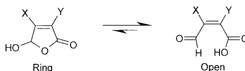
Figure 2. General Structure of MX (See Table 1 for the substituents.)

data supporting that ring form is being more mutagenic. There is also some spectral data that open form reacts directly with DNA bases. MX by its open form reacts with DNA base at physiological conditions. However this takes too long time (several days) and the yield was too low. Therefore it still remains unsolved that which one of the two forms is responsible. To solve this puzzling problems there have also been many studies of using quantitative structure activity relationship (QSAR) study. Tuperainen et al. showed that there is high correlation between observed mutagenicity and energy level of LUMO (lowest unoccupied molecular orbital). Using only ring form. They showed that LUMO energy level inversely correlates with mutagenicity ( r = 0.985 ). This implies that the MX analogues act as electrophiles to react with DNA bases. 7-10 It is interesting that the mutagenicity did not show significant correlation with logP values. LaLonde et al. also studied both open form and ring form. They also have high correlation with LUMO and mutagenicity. In their study both the open form and ring form showed high correlation with the LUMO energy