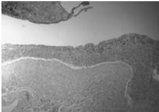
Fig. 3. Histology of the resected tumor. The tumor consists of a thickened collagenous wall and its content of mucoid substance(H-E stain, \times 100 ).

Uetani 9) 가 2~15 40 cm , , 1-10). Yamazaki (stretch 10) ing), (elevation), (compression) 가 3 cm , 1 cm 4) 71 . , , Fansa 4) 가 , (cystic , degeneration) , Aulisa 2) 3,8,9) , 가 , 2,8,9). Nucci 8) , Robert 가 , 40% . Lowensteine 7) .(Fig 가 , 2,B) , Stack , , 4