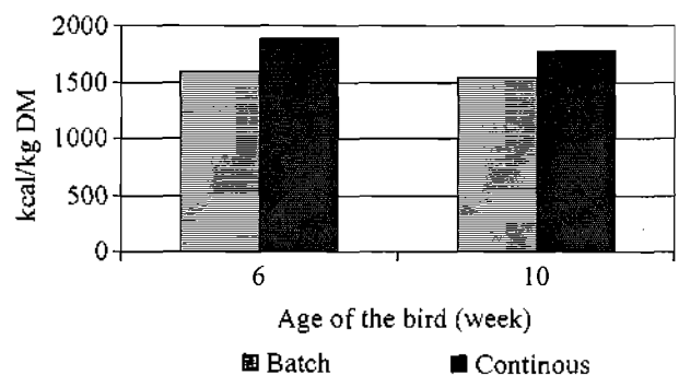
Figure 3. Effect of age of the quails on the AME value of DORB