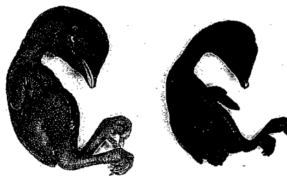
Figure 3. A \text{LacZ}^+ embryo stained with X-gal at 21th day of incubation. Infection with LN \beta Z retrovirus vector was made just before incubation. Left, a non-infected control; Right, an infected embryo expressing the E. coli LacZ gene.

To each freshly laid egg, 10 \mu l of pre- or 100X post-concentrated virus stock was injected beneath the blastoderm, then incubated for 20 days before X-gal staining.