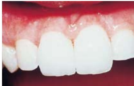
Figure 8d. After the first composite resin veneer was completed, the next direct composite resin veneer was sculpted on the upper left central incisor to perfectly match the first.