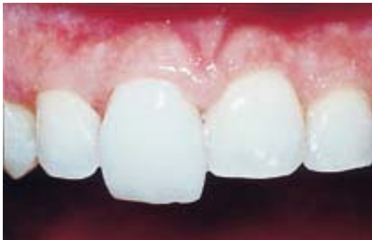
Figure 8c. To increase the morphology of the teeth, direct composite resin veneers were hand-sculpted individually to full polish.