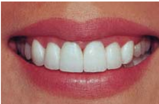
Figure 4b. Post-treatment-Cosmetic and reconstructive rehabilitation.