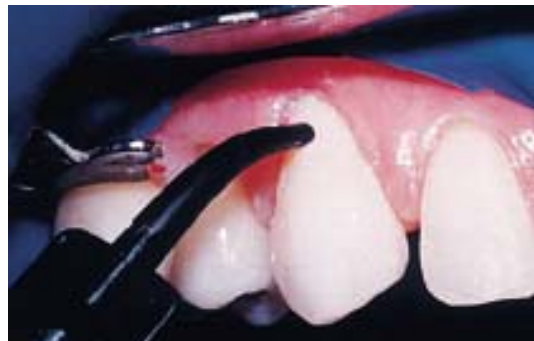
Figure 6b. Flowable composite resin(Permaflo by Ultradent Corp.) used to restore abfraction.