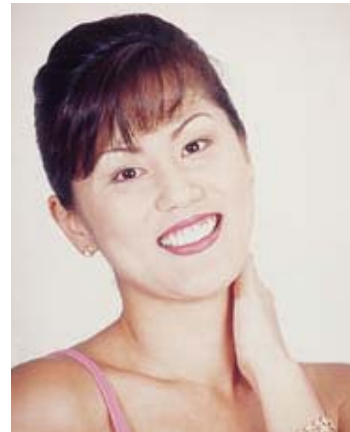
Figure 4c. Post-treatment - Due to correct approach to cosmetic rehabilitation, patient has regained their self-esteem and self-confidence.