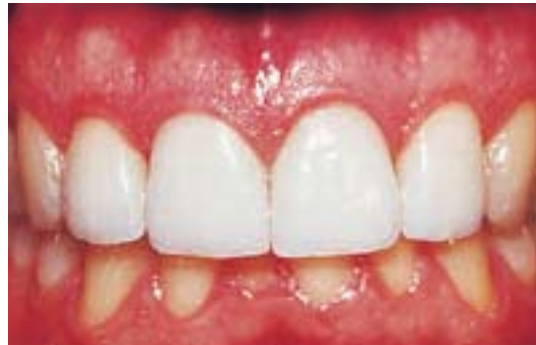
Figure 5b. Post-treatment - Incisors brightened by properly restoring with porcelain veneers.