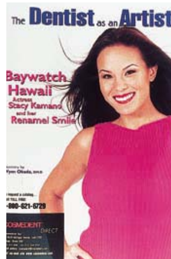
Figure 9. Using conservative procedures, such as teeth bleaching and direct composite resin veneers, the dentist can create beautiful esthetic results and be considered an artist.