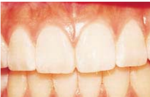
Figure 2a. Pre-treatment - Intrinsic stained dentition.