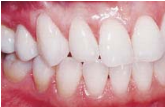
Figure 6e. Post-treatment - Following the home bleach treatment, abfraction and diastema problem is conservatively treated with composite resin.