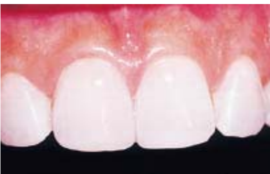
Figure 7d. Esthetic enhancement with conservative treatment using home bleaching and new microhybrid composite resin.