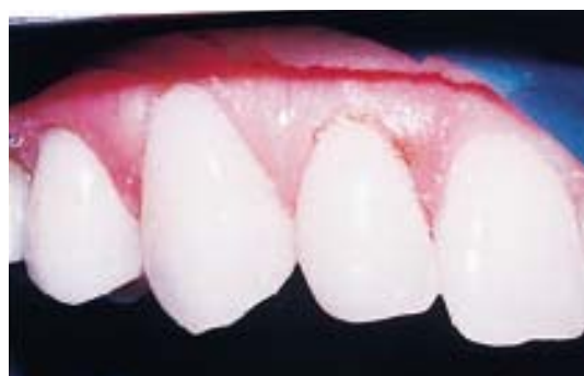
Figure 6d. Diastema is closed using conservative composite resin technique.