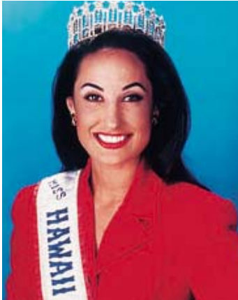
Figure 3. Indirect porcelain veneers completed to create harmonious proportion of dentition to the face. When optimal proportions are obtained, a dynamic facial appearance is created.