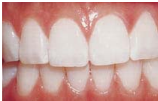
Figure 2b. Post-treatment-Home bleach treatment.