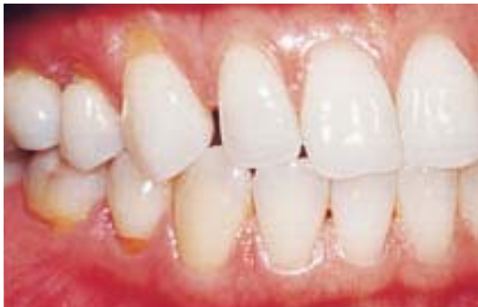
Figure 6a. Pre-treatment - Existing abfraction and diastema problems in the intrinsic stained dentition.