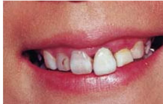
Figure 4a. Pre-treatment- Multiple esthetic related problems. Patient is not a bleach candidate.