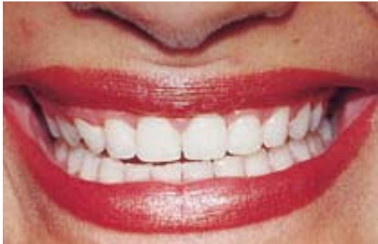
Figure 8a. Although teeth are in good alignment, the perioesthetic line is not symmetrical and an open bite exists from the upper right second premolar to the left second premolar.