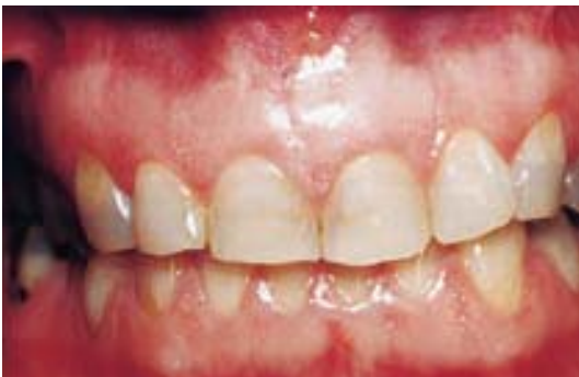
Figure 1c. Pre-treatment - esthetics and functional-related problems.