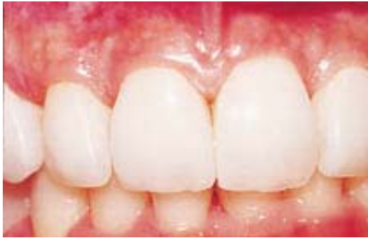
Figure 8g. Post-treatment - Direct composite resin veneers were hand-sculpted to create a beautiful end result.