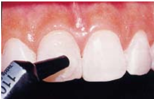
Figure 7b. Placement of microhybrid composite resin(Tetric-Ceram by Ivoclar - Vivadent) after home bleach treatment increased brightness (value) of dentition.