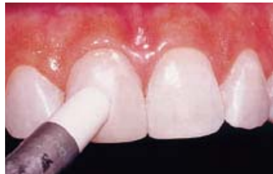
Figure 7c. Composite resin is sculpted using a silicone brush.