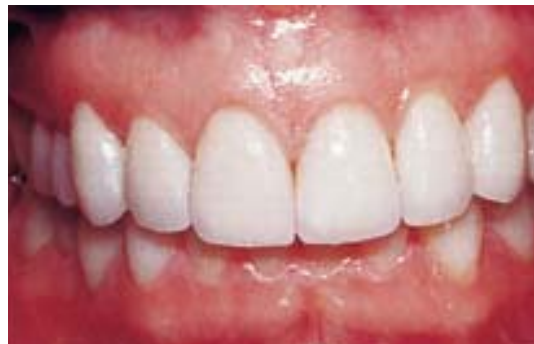
Figure 1d. Post-treatment - esthetic and functional correction with bonded porcelain restorations.