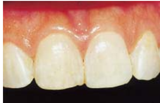
Figure 7a. Pre-treatment - Intrinsic stained dentition, with unesthetic asymmetrical central incisors.