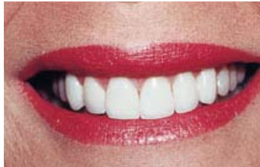
Figure 1b. "The Ultimate Smile" - Full mouth cosmetic and reconstruction rehabilitation with bonded porcelain restorations.