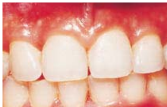
Figure 8f. Pre-treatment - Existing teeth are proportionately too small for the patient's face.