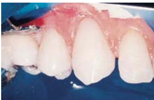
Figure 6c. Abfraction problems along cuspid and premolar is corrected with composite resin.