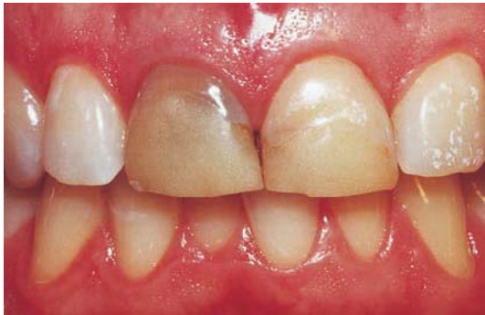
Figure 5a. Pretreatment- Proper diagnosis determines that central incisors are not good candidate for bleaching.