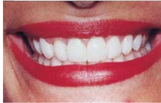
Figure 8h. In one appointment, direct composite resin veneers were bonded from the upper right second premolar to the left second premolar to create a proportionately more dynamic smile.