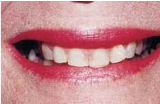
Figure 1a. The typical aged dentition of the middle-aged woman.