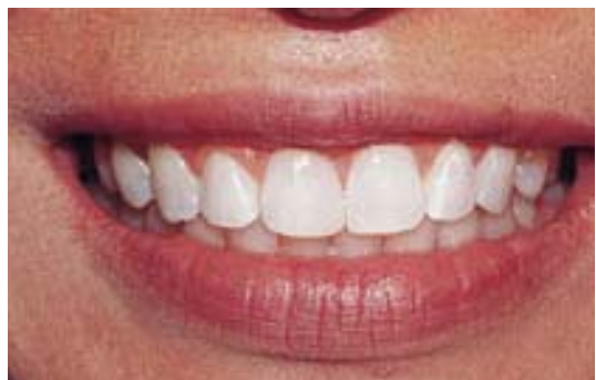
Figure 7e. Smile is enhanced using conservative cosmetic treatment.