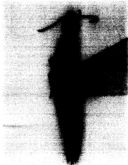
Fig. 1. Habitus of Diochus japonicus Erichson.

Subfamily Staphylininae Latreille, 1802 반날개아과 Tribe Diochini Casey, 1906 뽕족머리긴반날개족 (신칭) Genus Diochus Erichson, 1839 뽕족머리긴반날개속 (신칭) Type species: D. nanus Erichson