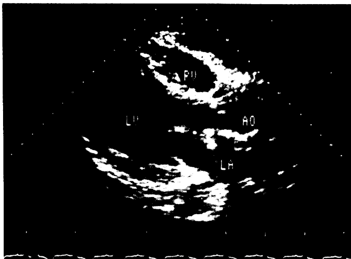
Fig. 3. Preoperative echocardiogram.

The aortogram confirmed the presence of ascending aortic aneurysm with grade IV aortic regurgitation, showing no definitive intimal flap(Fig. 3).