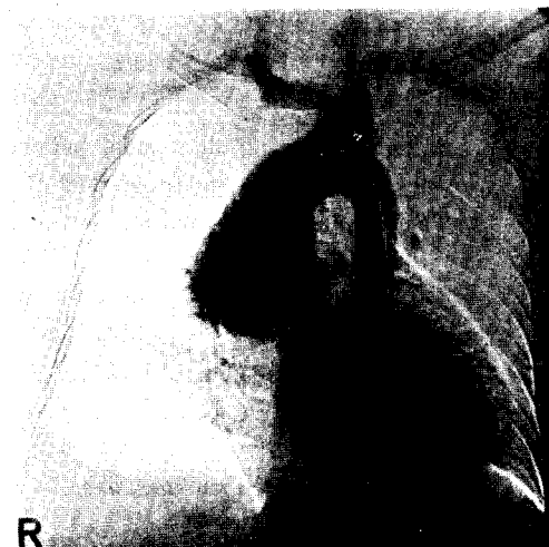
Fig. 2. Preoperative angiogram of the ascending aortic aneurysm.