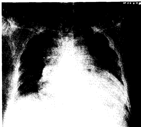
Fig. 1. Roentgenogram of chest at admission.

An echocardiogram revealed an aneurysm on the proximal ascending aorta, left ventricular enlargement and severe aortic regurgitation (Fig. 2).