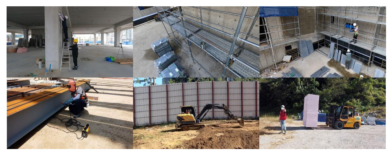
Figure 3. Examples of used scenario image