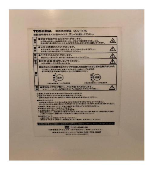
Figure 4: manufacturer information (Japanese)