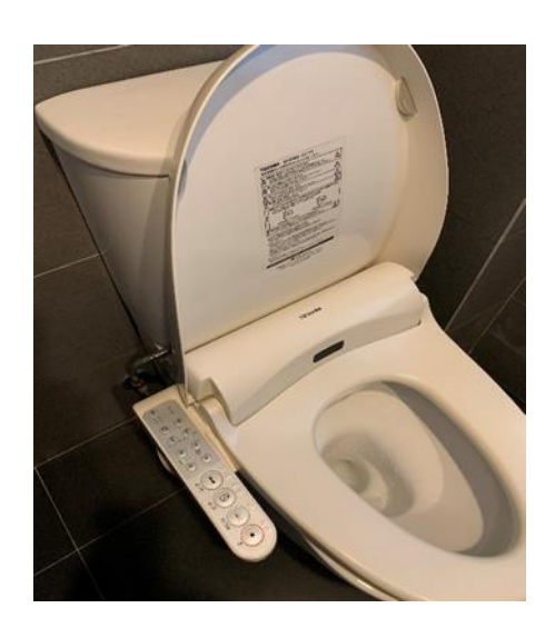
Figure 2: digital toilet in hotel

In December 2023, the author visited Hanoi, Vietnam, and stayed in a number of hotels. One hotel had a digital "intelligent" toilet technology installed in the bathroom (figures 2-4). This "smart" technology may be defined as a toilet with the added enhancement of SMART home technology [16]. This positive surprise (this being the first time the author had seen the technology) turned to disappointment: the printed instructions were in Japanese; the hotel had not provided any guidance; nor was I signposted to any information online. As a result, I could not make use of the technology, nor expand my understanding of it. As a result, my encounter was negative in that I left the hotel ignorant of what the technology could do for me. From a sustainability perspective, such a fully functioning technology could make a positive impact for the individual, the hotel and the city authorities. However, encountering the redundant technology felt like a missed opportunity. I was left to think over the experience — what did my negative experience tell me about innovative technologies used in construction work? Could anything be learned from the experience? Following further thought, the author decided to conduct a socio-technical systems analysis of the technology, as encountered in the hotel.