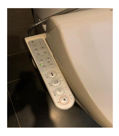
Figure 3: control pad