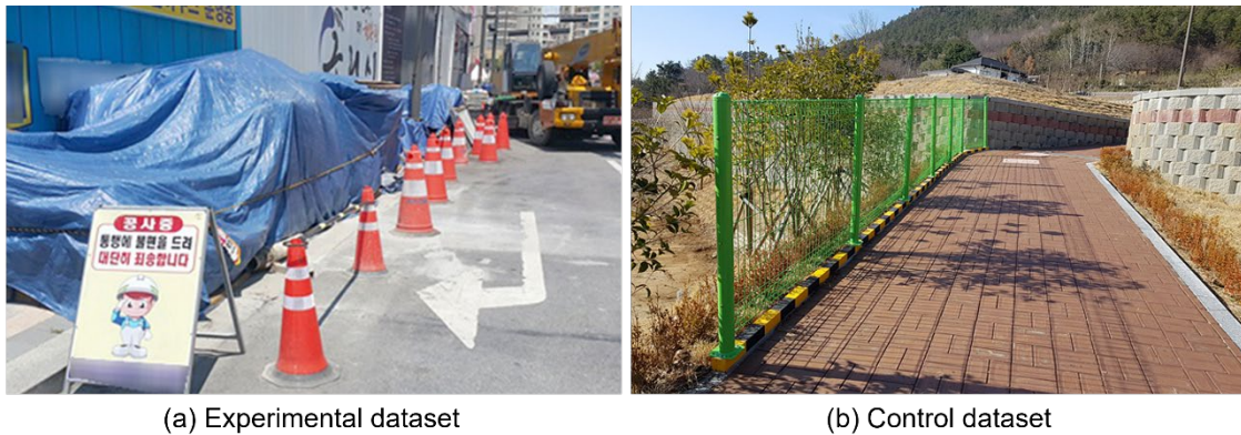
Figure 2. Representative photos from the experimental and control dataset