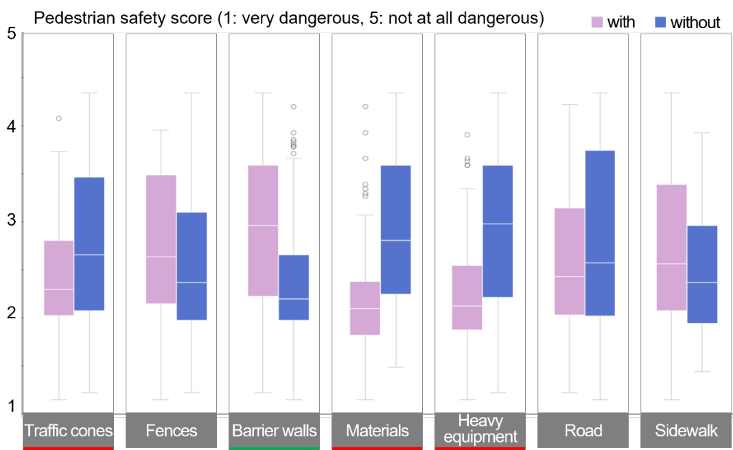
Figure 3. Boxplot of environmental impacts on pedestrian safety

Conversely, for factors with negative values in the mean difference, such as traffic cones, materials, and heavy equipment, significantly lower pedestrian safety scores were observed when these objects were present compared to when they were absent, as indicated in Table 3. This is because traffic cones often indicate ongoing construction activity or hazards, causing pedestrians to perceive higher risks. Similarly, the presence of construction materials and heavy equipment can create obstacles and reduce the available space for pedestrians, leading to a heightened sense of danger to pedestrians. On one hand, the presence of fences and sidewalks slightly raised pedestrian safety scores, while the presence of roads slightly lowered them. However, there was no statistically significant difference in the mean pedestrian scores between conditions for factors like fences, roads, and sidewalks. Fig. 3 presents a box plot that graphically demonstrates the impact of different environmental factors on perceived pedestrian safety. Factors that significantly improve pedestrian safety, such as barrier walls, are highlighted in green. In contrast, elements that have a statistically significant negative effect - such as traffic cones, materials, and heavy equipment - are marked in red.