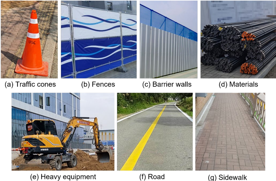
Figure 1. Environmental factors pertaining to pedestrian safety