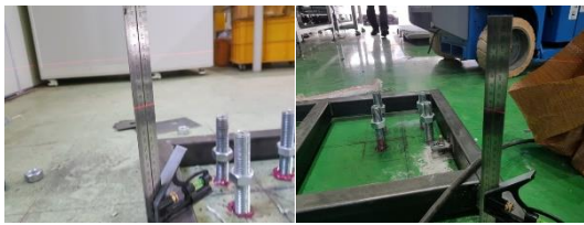
Fig. 2. Installation of Anchor.

The dry room was constructed following the procedure. Followed figures are photos during the construction.