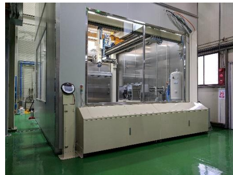
Fig. 6. Constructed Dry Room.