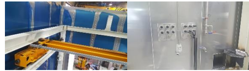
Fig. 5. Installation of Crane Structure and Utility Ports.