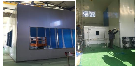
Fig. 4. Installation of Wall Panel.