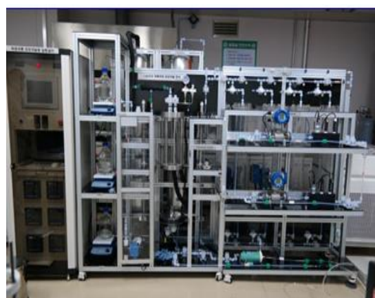
Fig. 1. System Decontamination Process Development Equipment.

was analyzed using inductively coupled plasma-optical emission spectrometry (ICP-OES).