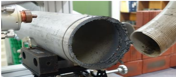
Fig. 3. View of the stainless steel pipe of 165 mm diameter after first cutting.

The next cutting experiment was carried out at a speed of 50, 70, 100 mm/min for a stainless steel (SUS304L) pipe with a diameter of 165 mm and a thickness of 7 mm. The cutting interval for each cut line was also 30 mm. When cutting at a speed of 50 mm/min, the pipe was completely cut at one time. As shown in Fig. 3, when cutting at a speed of 70 or 100 mm/min, the pipe was incompletely separated or parts of the pipe was not cut due to the effect of the dross. Therefore, the cutting was carried out again in the opposite direction after the first cutting, and in this case, it was completely cut. Fig. 4 shows the cut pieces of the stainless steel pipe with a diameter of 165 mm and a thickness of 7 mm.