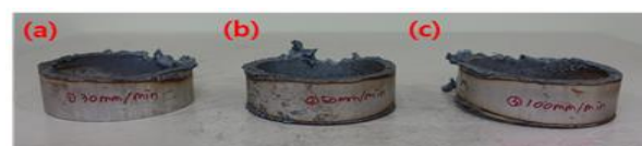
Fig. 2. Cut pieces of the stainless steel pipe with 90 mm diameter after laser cutting at speeds of (a) 30 mm/min, (b) 50 mm/min, (c) 100 mm/min.

The first cutting experiment was carried out at a speed of 30, 50 and 100 mm/min for a stainless steel (SUS304L) pipe with a diameter of 90 mm and a thickness of 5.4 mm. The cutting interval for each cut line was 30 mm. The pipe was completely cut with one scan of the laser beam for all cutting speeds. Fig. 2 shows the cut pieces of the stainless steel pipe with a diameter of 90 mm and a thickness of 5.4 mm.