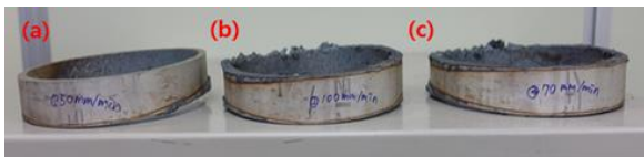
Fig. 4. Cut pieces of the stainless steel pipe with 165 mm diameter after laser cutting at speeds of (a) 50 mm/min, (b) 100 mm/min, (c) 70 mm/min.