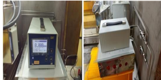
Fig. 1. Experimental apparatus (Oxygen meter).

The Oxygen meter used in this experiment is shown in Fig. 1.