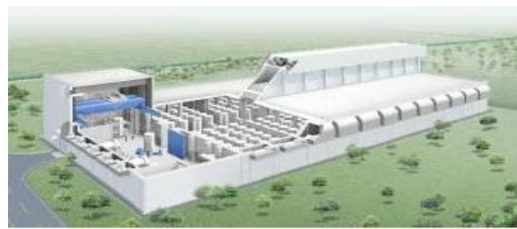
Fig. 4. Indoors Storage Type.

Indoor storage is more popular in Europe and Japan, where countries have limited lands and are densely populated. These facilities are excellent in terms of security and safety as they take into account external threats such as aircraft collision into an outside building. They tend to be better perceived by the local residents as well. In Germany, most of storages use a metal cask in the building. In addition, Japan has pursued indoor storage facilities to accommodate its spatial restraints, and built Mutsu interim storage facility, Asia's first indoor storage facility.