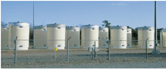
Fig. 3. Concrete Silo.

2.2.2.2 Concrete Silo. Concrete silo is basically similar to the metal cask technique. This method is less expensive than the one using a metal cask, but has several shortcomings, including lower resistance to heat and shocks and poorer cooling performance.