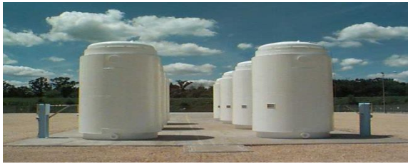
Fig. 2. Metal Cask.

2.2.2.2 Concrete Silo. Concrete silo is basically similar to the metal cask technique. This method is less expensive than the one using a metal cask, but has several shortcomings, including lower resistance to heat and shocks and poorer cooling performance.