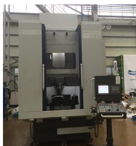
Fig. 3. Milling Equipment.

In addition, the automatic tool changing system was adopted so that tools were changed automatically during a set of operation without worker's intervention, thereby reducing the risk of workers' exposure and contamination.