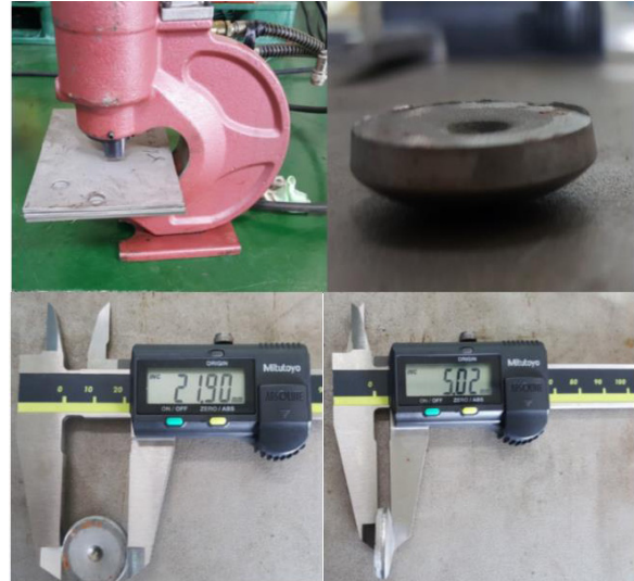
Fig. 3. Sampling.