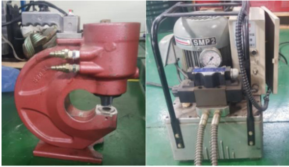
Fig. 2. Hydraulic punching machine and hydraulic pump.