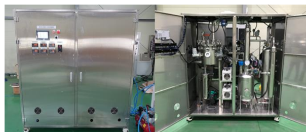
Fig. 2. Image of demonstration equipment.