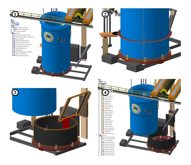
Fig. 3. Segmenting scenario of the reactor vessel.

nuclear facilities with low cost and high efficiency. The proposed simulator is expected to contribute the flexible planning and optimization of the nuclear facility decommissioning.