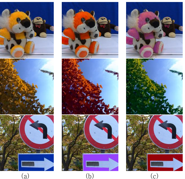
Figure 3 Additional edit results. (a) Extended focus image with user input; (b) \sim (c) Edited extended focus images