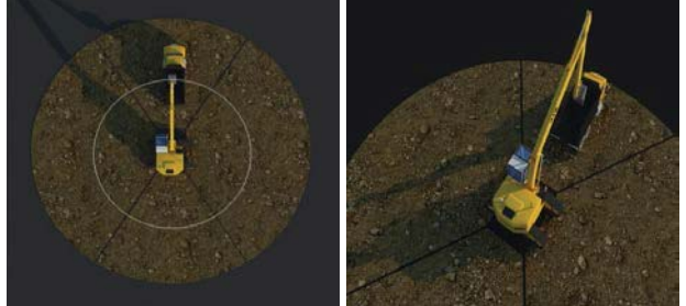
Fig 1. Construction Equipment Working Status Monitoring example B. Analysis of Optimal Installation Position of Construction Equipment Around-View Camera

It is necessary to develop monitoring technology that will enable a construction equipment operator to monitor the state of construction equipment (such as boom, arm, bucket movement, turning radius, and distance from the ground) on the AVM system screen as in Fig 1 and improve efficiency and productivity.