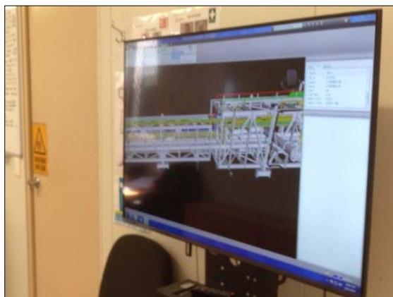
(B) CONSTRUCTION OFFICE PORTAL