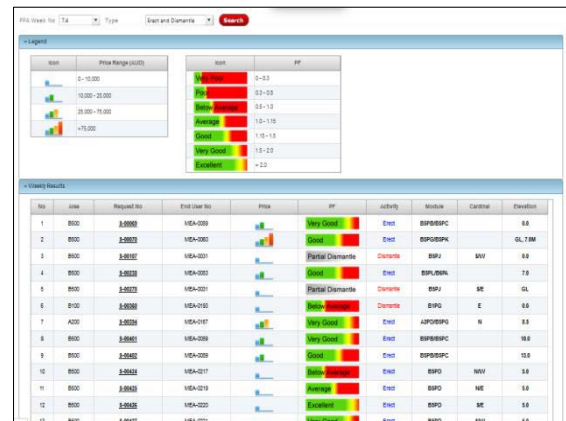
Fig. 4 PRODUCTIVITY DASHBOARD BASED ON THE WORK-PACK

Figure 4 shows an on-line information hub, the Productivity monitoring system. The figure includes logistics information of thirteen work-packs including ten erection and three dismantlement works. The logistics information covers area; request number; user information; workforce; cost; and process flow. The RFID-oriented resource control enables the monitoring of the productivities of work-packs in real-time. It can be distributed by both the mobile and on-site displays. The most important contribution of the on-line hub is the accessibility of the information, which manifests as a real-time information provider in a feed-forward mode.