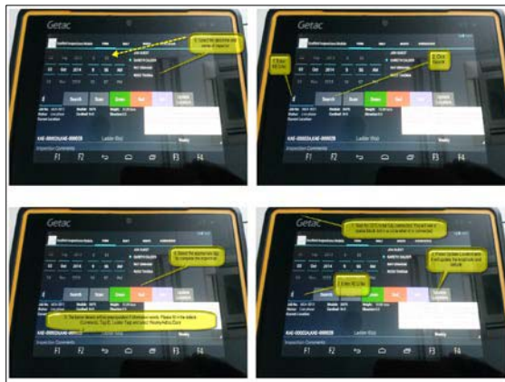
(A) MOBILE INFORMATION PROVIDER

reader and database. Finally, the logistics can be confirmed before the erection starts. Simultaneously, Figure 3-(b) presents an example to show how the information is visually distributed in the site office. The detected information is integrated with VDC models to provide a more effective source for communication.