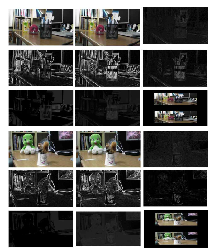
Fig. 2. Resulting DFD images

Fig. 2 shows input images and resulting images for two scenes. In the first image set, Subbaro's method extracts some acceptable depth information but it is not an ideal result. The final depth map is improved using combination of the edge blur method with basic depth. Subbaro in scene (b) fails to recover proper depth while the complimentary method improves final depth map.