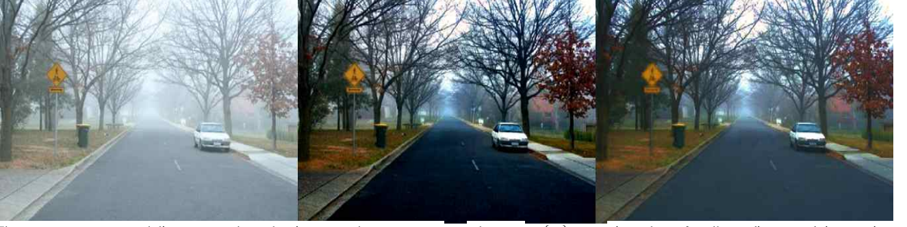
There are some several literatures about luminance enhancement that contains linear [5] and non-linear [6,7] methods. Each of