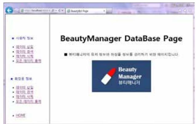
( 1 )